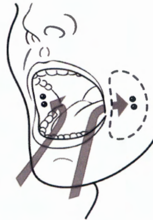
Figure A (2 tablets between your left cheek and gum and 2 tablets between your right cheek and gum).